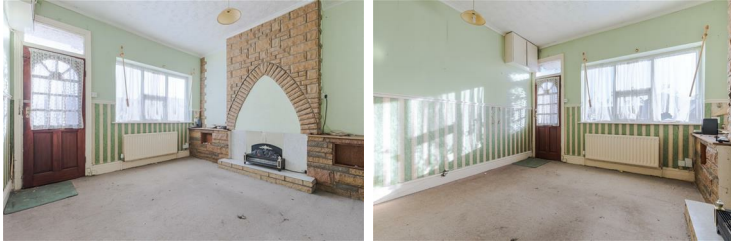
Lounge 12'3" x 11'11" (3.74m x 3.64m)