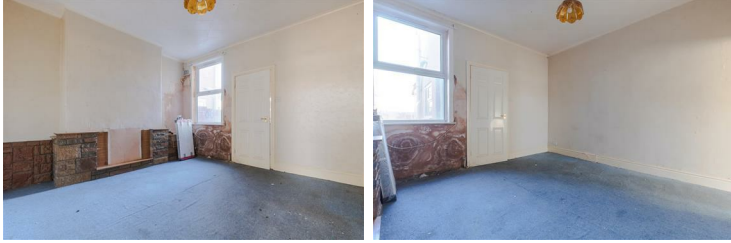
Dining room 12'7" x 12'3" (3.84m x 3.74m)