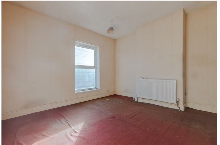
Bedroom two 12'3" x 11'11" (3.74m x 3.64m)