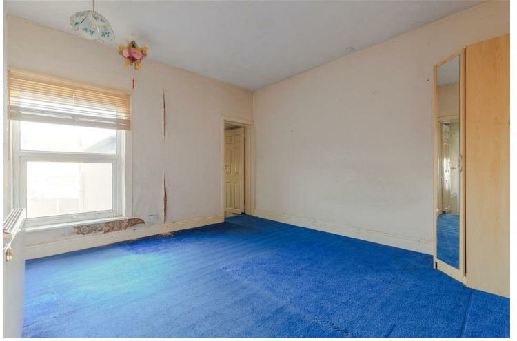
Bedroom one 12'11" x 12'3" (3.94m x 3.74m)